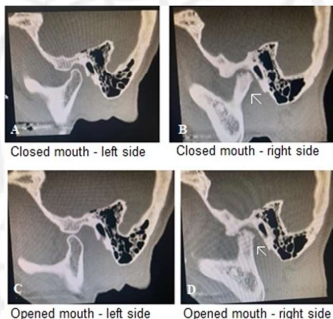
Figure 1. Computerized tomography of temporomandibular joints. A and C shows normal temporomandibular joints. B . White arrow indicating sclerosis and degeneration of right condyles and mandibular ramus. D . White arrow showing the lack of condyle translation during opened mouth. B and D shows degeneration and narrowing of the right mandibular fossa.

swallow, adopting flexed posture of head to feed only semiliquid food. Her neurological examination showed anterocollis with mild torticollis and head inclination to right, as well as maintained opened mouth. No other neurological problem. When asked to eat a cookie she showed sialorrhea, pain in the temporal region of head, click sound and dislocation in the right temporomandibular joint (TMJ). CT-Scan of her TMJ showed bone sclerosis of the right mandibular ramus associated with thin joint space and flattening of articular surfaces (Figure 1). BoNT-A injection was performed in her middle and posterior scalenus and both ECM as well as right lateral pterygoid muscle under guided EMG. One week later she reported improvement of pain and she could close her mouth, speak and she began to eat regular diet (Figure 2). She is now under multidisciplinary rehabilitation with special care to improve swallow and TMJ protection.